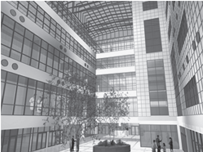
Figure 18.1 Interior and exterior of a modern laboratory in the year 2026, showing modular open laboratories built to high specification and ergonomically designed.