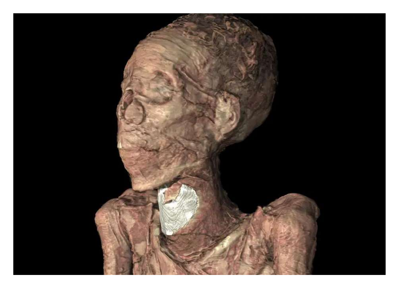
Figure 6. A 3D model of Egyptian chantress Tamut's face

figure 6). Currently digital autopsy is being successfully used in many countries like Switzerland, The United States of America, The United Kingdom, Malaysia, and Japan. iGene is a UK company currently offering 'effective, efficient, respectful, appropriate, timely and professional Digital Autopsy service to the Office of Her Majesty's Coroner and bereaved families <sup>'33</sup>. That is not to say traditional autopsies need to be forgotten, but digitalization offers a new perspective and unique possibilities.