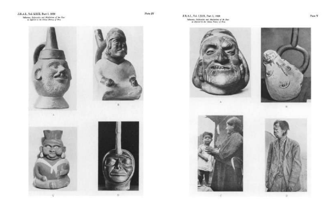
Figure 4 . Deformities and mutilations of the face as depicted in the Chimu Pottery of Peru, Redcliffe N. Salaman.[ref.17]

epidemic occurrence – have been recorded by ancient writings of Greek, Chinese, Roman, Assyrian, Indian, Arabic, and European physicians up to the 19th century<sup>16</sup>. Figure 4 . depicts photos of deformities and mutilations of the face as depicted in the Chimu Pottery of Peru. Cleft lips are obvious in photo A and B<sup>17</sup>, and although these figures are from 900AD, they are not unlike 21<sup>st</sup> century presentations of facial abnormalities.