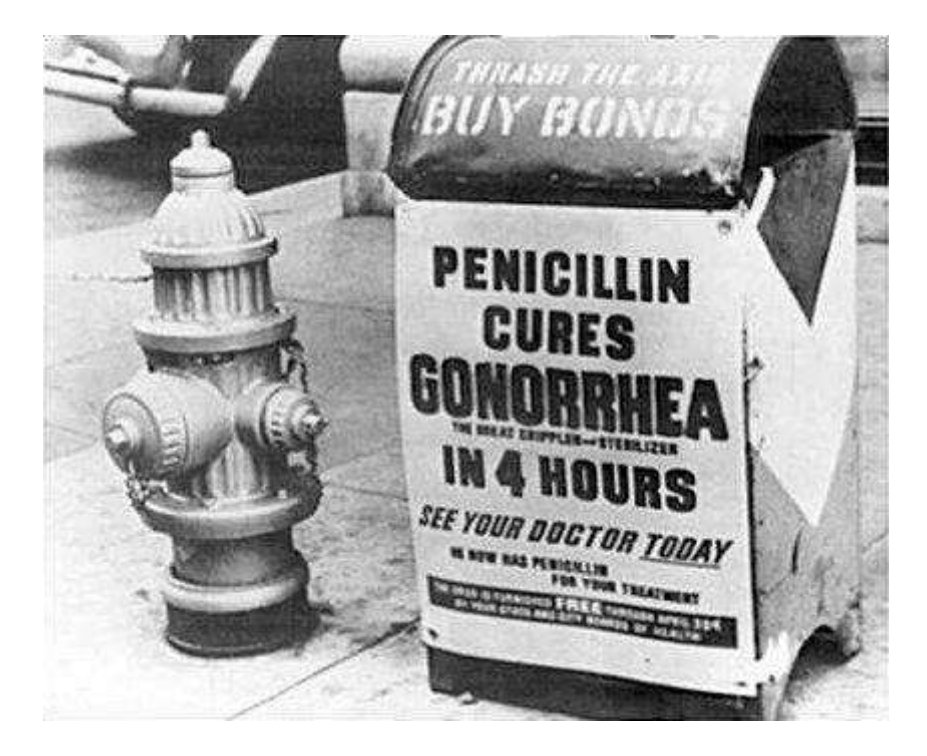
Figure 5. This poster attached to a curbside mailbox offered advice to World War II servicemen: Penicillin cures gonorrhea in 4 hours. (Photo: © National Institutes of Health).

Perhaps if there was a greater emphasis on the pathogenesis of microbial resistance doctors at all stages would hesitate when prescribing broad-spectrum antibiotics. 1950 to 1960, the golden age of antibiotic discovery, resulted in nearly 50% of the drugs commonly used today. Although transferable resistance identified in Japan as early as the 1950s, many believed antimicrobial resistance would be a rare event<sup>21</sup>. In the 1940s it was advertised that penicillin could 'cure gonorrhea in less than 4 hours!' (figure 5). In modern times, resistance is at such a peak cephalosporins may be the last antibiotics left to treat it, and other STI's are developing resistance too<sup>22</sup>.