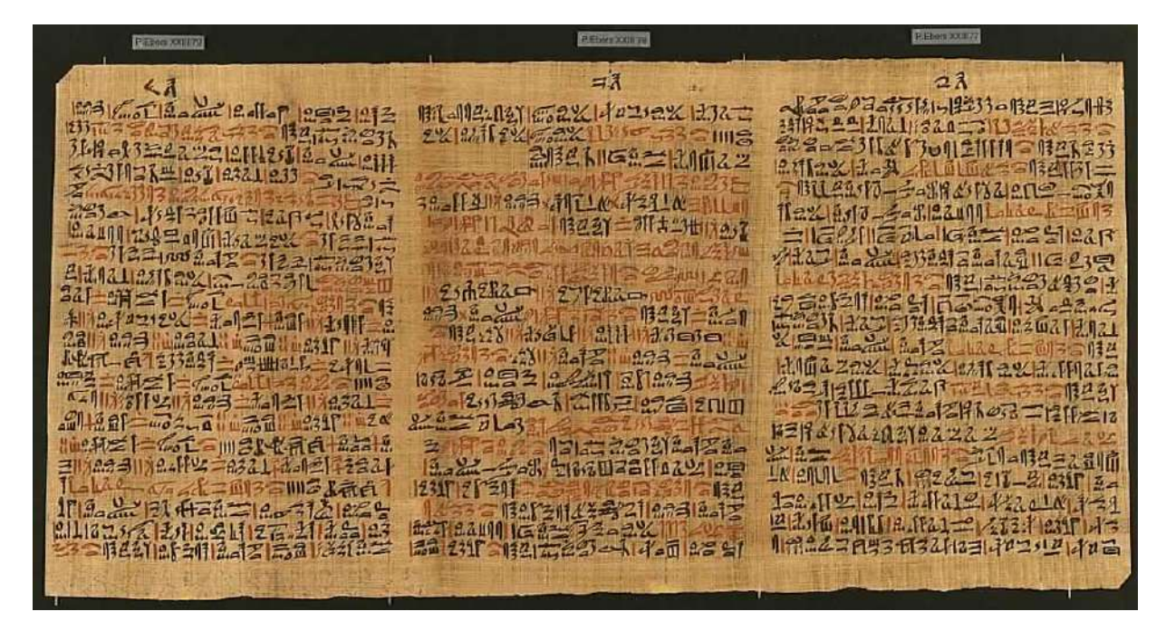
Figure 1. The Ebers Papyrus. [ref 4]

Soon people wanted to know why a person died- what exactly had gone wrong. The first recorded autopsies were carried out around 300 BC by doctors in Alexandria, who were allegedly supplied with criminals to vivisect to further their anatomical understanding<sup>5</sup>. In 44 BC, Julius Caesar was the subject of an official autopsy after his murder by rival senators, the physician's report noting the second wound received by Caesar was the fatal one<sup>6</sup>. In 131-201AD, the Greek doctor Galen of Pergamon correlated patient symptoms and complaints with findings on autopsy<sup>7</sup>. As pathological understanding developed from Hippocrates's four humors to Andreas Vesalius's book 'The fabric of the human body', medicine and medical education too evolved (figure 2).